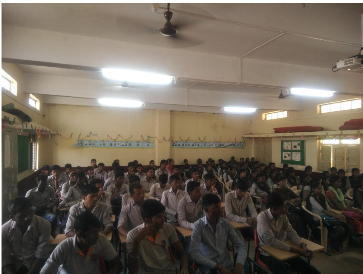
Students attending this event.