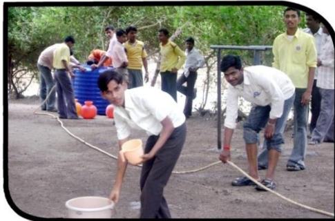
विशेष वार्षिक शिबीराची पूर्व तयारी