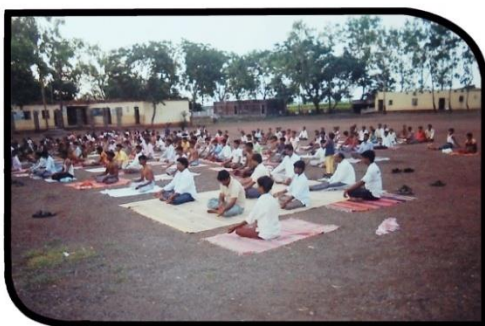
Yogas for better Living