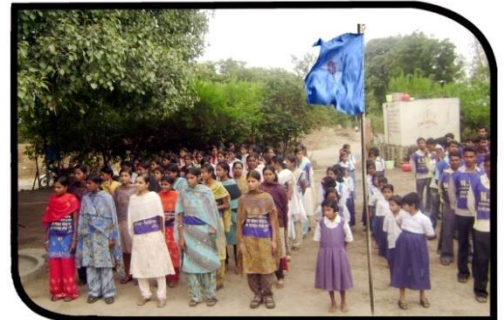
ध्वजारोहण प्रसंगी स्वयंसेवक