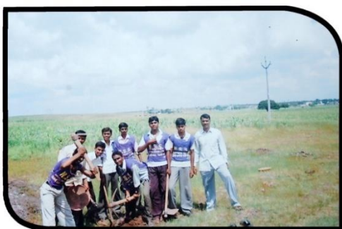
मौजे अलियाबाद वृक्षारोपण तयारी