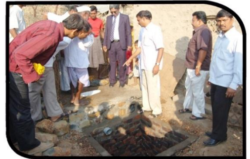
स्वयंसेवकांनी केलेल्या कामाची माहिती