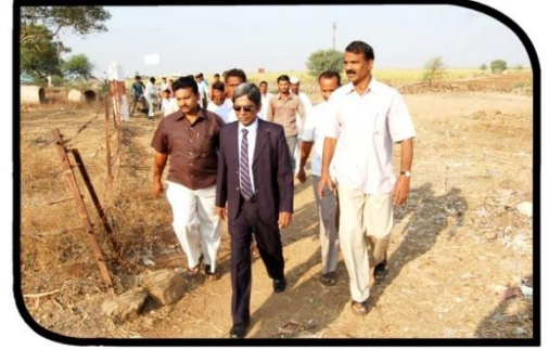
कामाच्या पाहणीसाठी प्रयाण.....