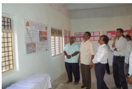
Poster Presentation in NCCAM-2010