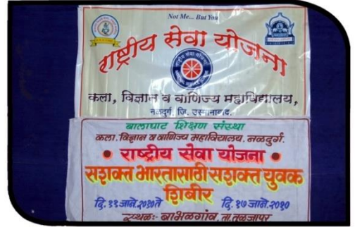
बाभळगाव येथे विशेष शिबीर सुरुवात