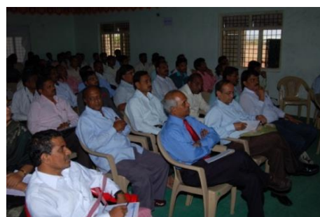
Scientists & Participants in NCCAM-2010