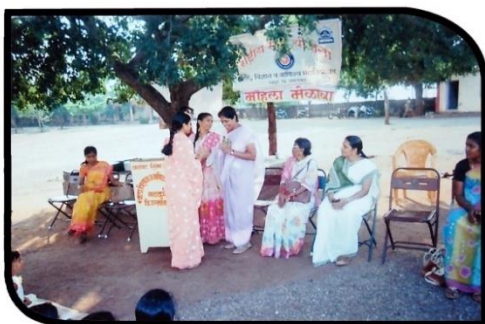
मौजे अलियाबाद,स्त्री शक्ती प्रदर्शन तर नव्हे ना .....