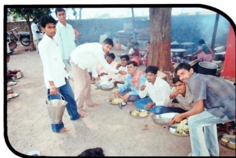
सावकाश होऊ द्या....