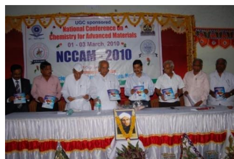
Publication of Proceedings of NCCAM-2010